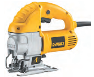
JIG SAW 4 POSITION ORBITAL ACTION DW317K • 1" Stroke, 0-3,100 SPM • 5.5 AMP Motor • Keyless Blade Clamp • Shoe Bevels 0-45° • Comes with Case