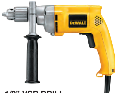
1/2" VSR DRILL DW235G • 1/2" Keyed Chuck • 7.8 Amp Motor, 0-850 RPM