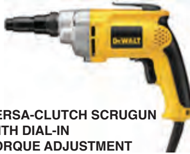
VERSA-CLUTCH SCRUGUN WITH DIAL-IN TORQUE ADJUSTMENT DW268 • 6.5 Amp Motor, 0-2,500 RPM