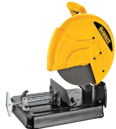
14" CHOP SAW D28710 • 15 AMP Motor • 45 Pivoting Fence • Spindle Lock • QUICK-LOCK® Vise • D-Handle Design