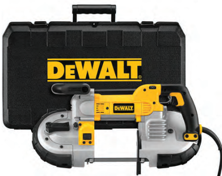
DEEP CUT BAND SAW KIT DWM120K • 10 AMP Motor • Cuts 5" Round • LED Work Light • Kit Box