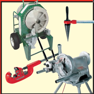
PIPE WORKING TOOLS