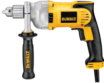
1/2" VSR PISTOL GRIP DRILL DWD220 • 10.5 Amp Motor • 0-1,200 RPM • 2-Finger Switch