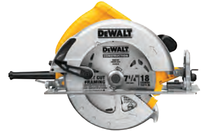
7-1/4" CIRCULAR SAW LIGHT WEIGHT DEWALT® DWE575 • 15 AMP Motor • Aluminum Base • 2-9/16" Cut Depth • Carbide Tip Blade