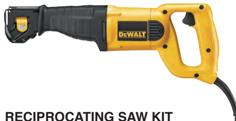
RECIPROCATING SAW KIT ORBITAL ACTION, VARIABLE SPEED DW304PK • 1-1/8" Stroke, 0-2,800 SPM • Keyless Blade Clamp • 10 AMP Motor