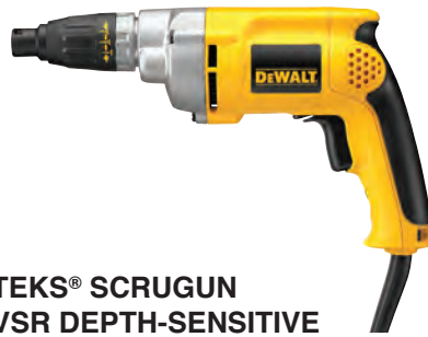
TEKS® SCRUGUN VSR DEPTH-SENSITIVE DW266 • 6.5 Amp Motor, 0-2,500 RPM