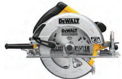
LIGHTWEIGHT 7-1/4" CIRCULAR SAW WITH ELECTRIC BRAKE DWE575SB • 15 AMP Motor • w/Carbide Tipped Blade