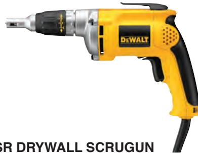
VSR DRYWALL SCRUGUN DW272 • 6.3 Amp Motor, 0-4,000 RPM • with "Set and Forget" Nosepiece