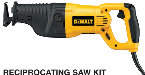
RECIPROCATING SAW KIT DW311K • 13 Amp Motor • 1-1/8" Stroke Length • 0-2,700 SPM • Keyless Blade Clamp