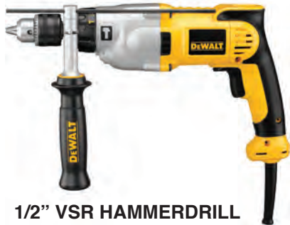
1/2" VSR HAMMERDRILL DWD520 • 1/2" Keyed Chuck • 10 Amp Motor, 2 Speed